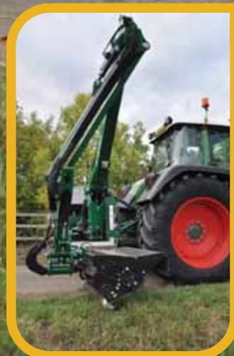
Flailhead can be tucked behind the wheel when in rearward position