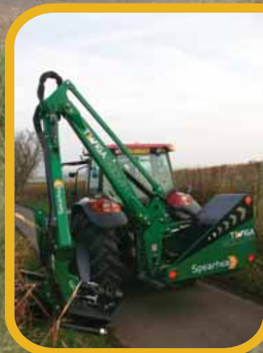
0.9m Rearward reach for narrow lane cutting